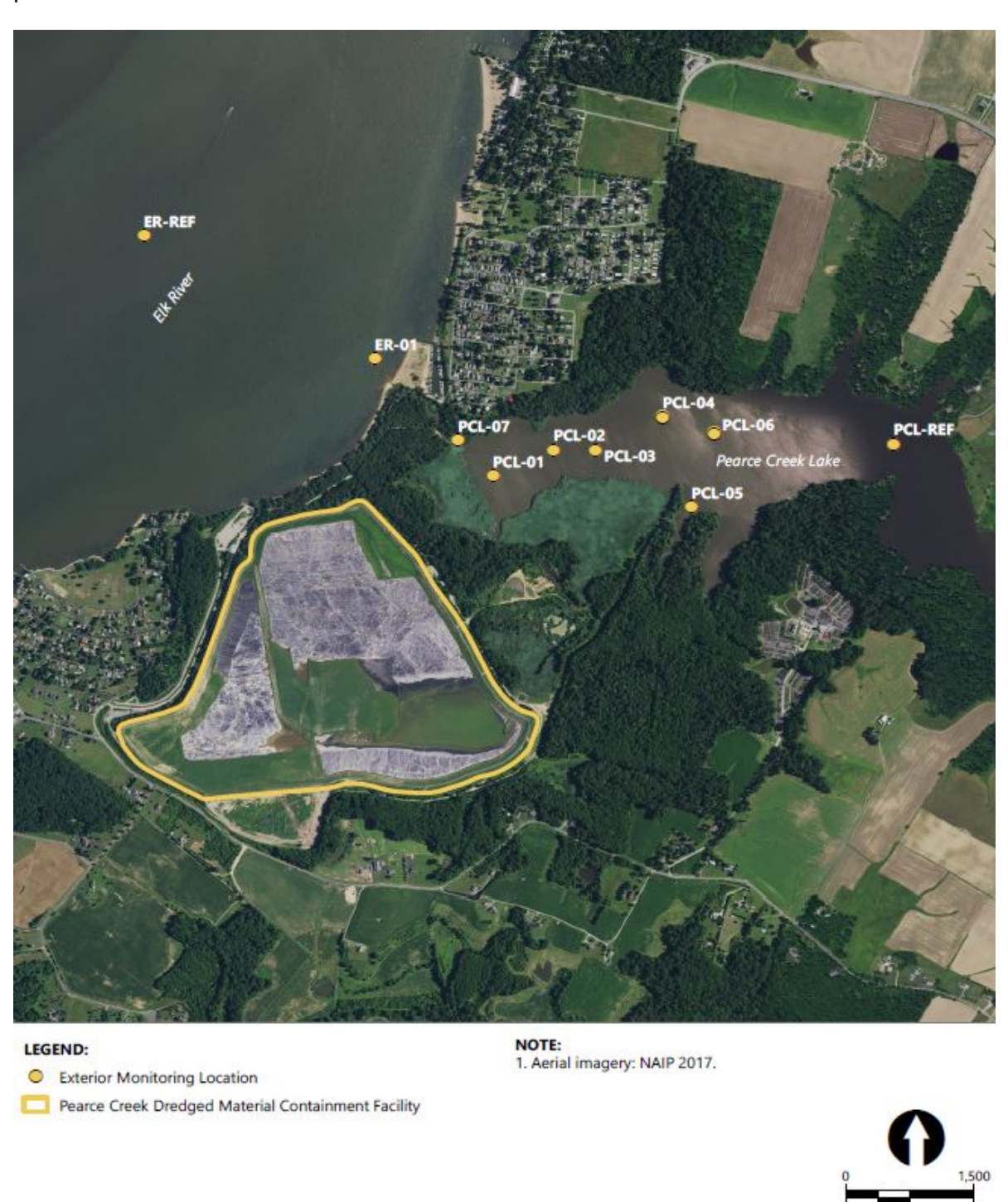
FIGURE 1. EXTERIOR MONITORING LOCATIONS

This monitoring event is the third post-placement monitoring event since dredged material placement began in late 2017 at the Pearce Creek DMCF. The frequency of exterior monitoring events beyond those planned through the fall of 2019 will be determined through the adaptive management process.